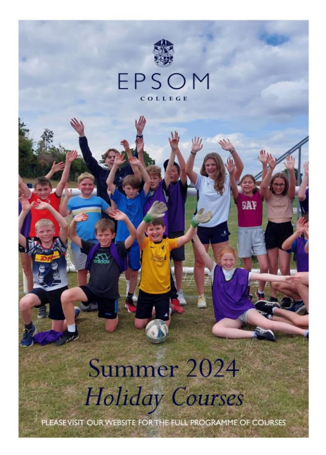
1 - <u>https://www.epsomcollege.org.uk/whats-on/summer-camps/</u>