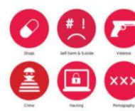
A Parent's Guide to Privacy Settings

Online safety is when young people know who they can tell if they feel upset by something that has happened online.