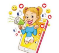
A Parent's Guide to Online Influencers