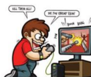
A Parent's Guide to Gaming