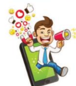
A Parent's Guide to Live Streaming