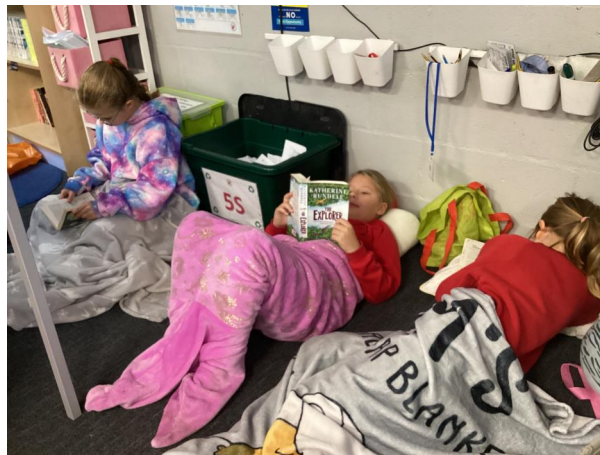
2 - Cosy Reading