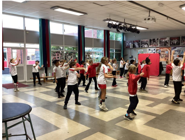
1 - African Dance Workshop

On Friday 14 November 2025, our school community came together to celebrate Wellbeing Day , a special occasion dedicated to promoting happiness, mindfulness, and a sense of calm. Pupils enjoyed a variety of enriching activities designed to support both emotional and physical wellbeing. Highlights included an energetic African Dance Workshop that encouraged movement and joy, cosy reading sessions that provided time for relaxation, and a range of mindful and wellbeing activities to help pupils reflect and recharge.