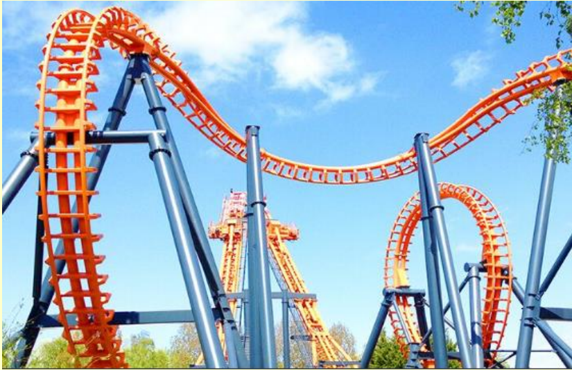
Bagatelle Theme Park