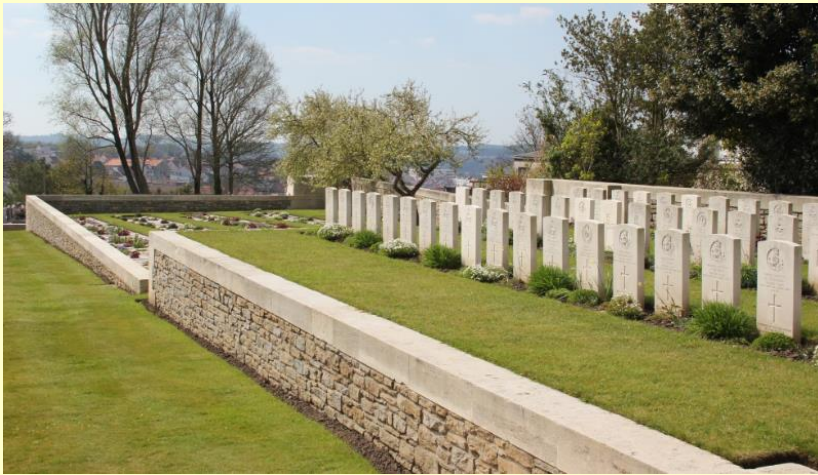
Boulogne-sur-Mer Commonwealth War Cemetery