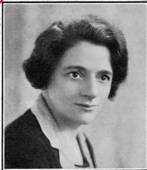
MISS ELLEN WILKINSON travailleuse

Ellen Wilkinson (1891-1947) was a Labour Party politician and MP for Middlesborough East (1924-1931) and Jarrow (1935-1947). She spoke passionately in favour of women's interests, including equal pay. Ellen became only the second woman to obtain a position in the Cabinet and was responsible for increasing the school leaving age to 15. She also participated in the 'Jarrow Crusade', where 200 unemployed men marched from Jarrow in northeast England to London, protesting against unemployment and poverty.