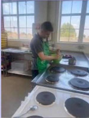
KS4 making flap jacks in Food Tech