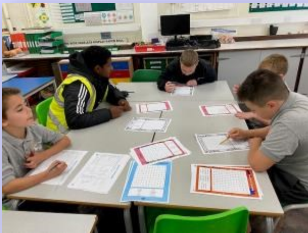
Children in Green class worked together in Tutor Time . They do word search, times table and watch Junior Nationwide for the current events.

KS3 Outdoor Science Project: What happens when you drop Mintoes into a bottle of Cola???