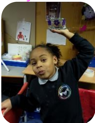
Metal rings and flowers piece