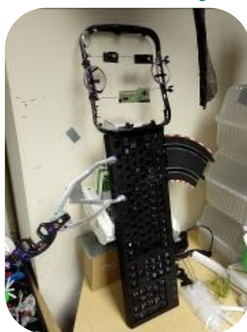
Lorenzo's finished robot.