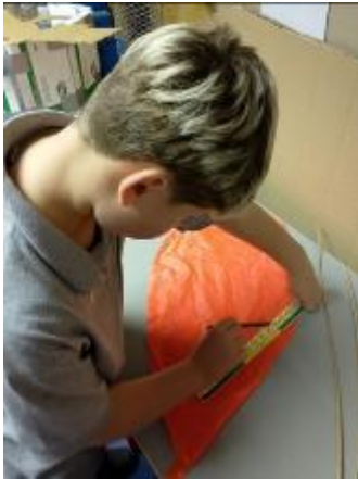
Drawing out a kite on kite fabric