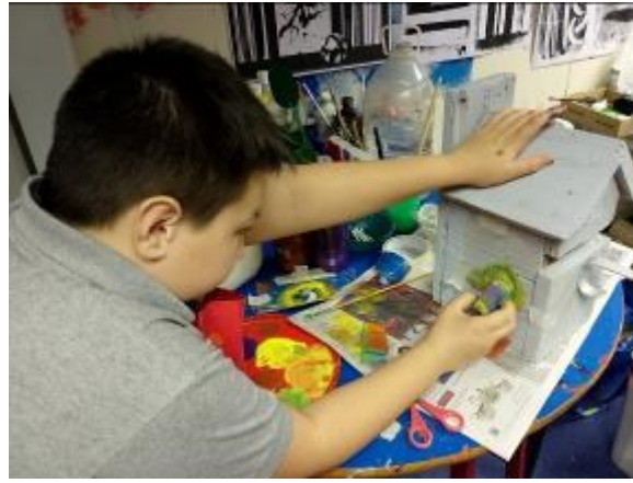
Nest Box—nature images being stencilled onto the box in time for the Spring bird visitors. This will be installed into the school garden when complete!