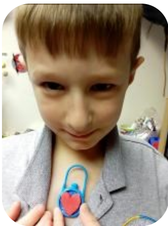
This heart detector can seek out hearts that are good or evil!