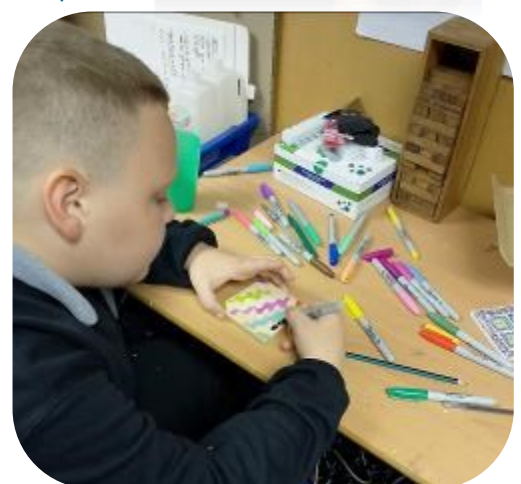
Ceramic tile decorating