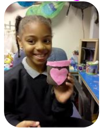
Heart pot decorated with love