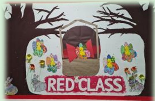
Primary Easter Board outside Red class