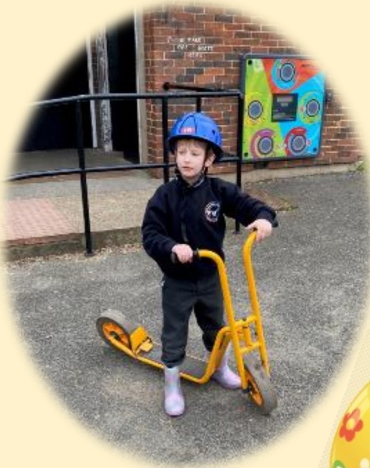
Year 2 pupil scooting at break time