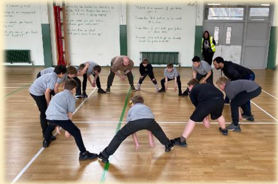
Primary pupils enjoying their PE lesson on Tuesday