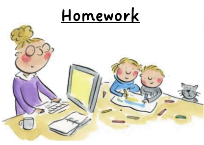
Daily ~ Reading to an adult at home every day ~ Learning spellings

Reading is so important for your child's development and progress across the curriculum, so please encourage your child by listening to them as often as you can.