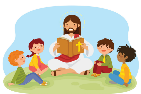
2.1 The Bible

Key Questions Why is the Bible special? Why does the vicar/minister think that the Bible is special? Which Bible stories do you enjoy? Why? Who uses the Bible? Why? The Bible is in two parts which are different. Why/how are they different?