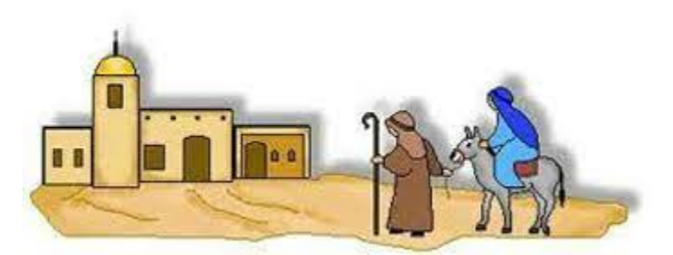
Christmas - The journey to Bethlehem