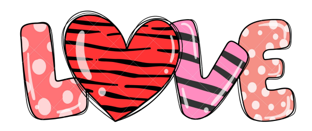
John 15:12: My command is this: Love each other as I have loved you.