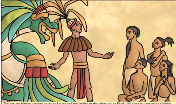
"We can see forever, through rocks and trees and mountains to the edges of the Earth. We can see your entire creation, with all of its animals and plants. We can see and understand everything!" Tepu and Gucumatz looked at each other, "Perhaps we made these beings too well... they should not see as well as WE do!" The makers removed some of the men's vision. After that they could only see things close to them, and they were no longer able to see through or above things that they should not. Thus their understanding of the world was weakened.