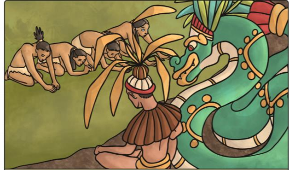
The new beings seemed perfect. They were sturdy enough to last and their minds were rich with thoughts and feelings. Their first act after their own creation was to immediately worship Tepeu and Gucumatz, and thank them for their lives. Tepeu and Gucumatz were pleased. "What do you see?" they asked the corn men.