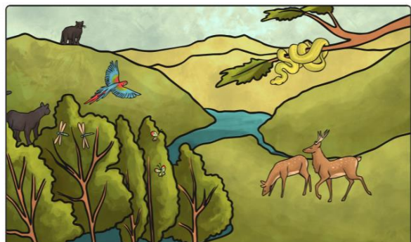
Tepeu and Gucumatz decided that they needed beings there to look after their vast creation, and to praise their names as the creators. So they created deer and birds and panthers and serpents, all the creatures that roam the Earth today. "Now praise us! Say our names!" commanded the creators.