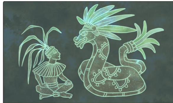
Before the world had a true form, there were two Gods. These Gods were Tepeu, the Maker and Gucumatz, the Feathered Spirit. While the world around them was dark, the two Gods glittered with brilliant blue and green feathers. They came together to create the world.