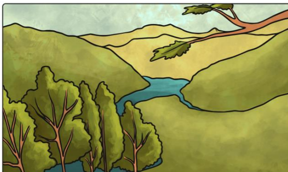
Whatever they thought came into being. When they thought "Earth", land formed in the darkness. They thought of mountains and valleys, pine trees and water and sky. All of these things appeared the instant they thought them, and thus the Earth was formed.