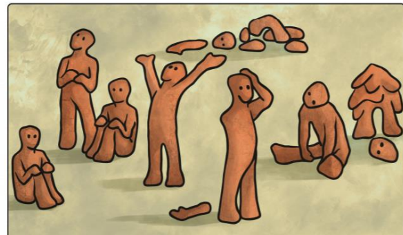
The first race of men were made from wet clay. The creators gave them life, and the first men tried to speak; but instead they crumbled apart soon after they were made. The Maker and the Feathered Spirit were determined to create a hardier race of men.