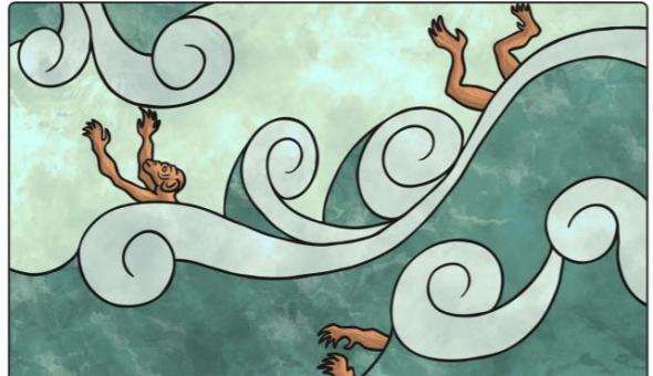
Tepu and Gucumatz sent a great flood down to destroy them. They commanded the animals to attack the survivors and tear them to pieces. The few who managed to escape fled to the woods and became monkeys. The creators left them there as an example to the next race of men.