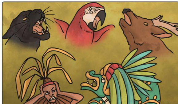
But the animals could only roar or howl, bleat, bark, twitter or moan. They tried as hard as they could to speak, but they could not. They chirped and mewled at the top of their lungs until the noise was so deafening, that Tepeu and Gucumatz ordered them to stop. Disappointed, the makers agreed that they would have to create better beings, ones who would be able to worship them properly.