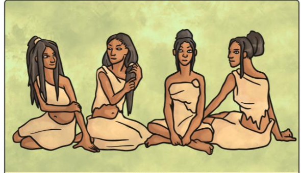
But the men still sang their creators' praises and settled down to live on the new land. Tepu and Gucumatz made four women to be their mates. These eight men and women were the ancestors of all Quiche men and women today. Even today their sight and understanding of the world is not perfect.