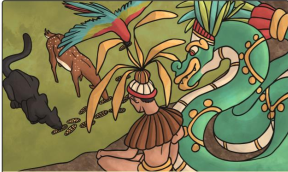
The Maker and the Feathered Spirit thought for a long time about how they should make the race of men they wanted. There seemed to be no perfect material to build them. Finally some animals brought the Gods a stack of white corn which grew on the far side of the Earth. Tepeu and Gucumatz ground this into a paste and from this formed four individual men.