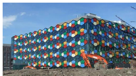
Local architecture and sculpture