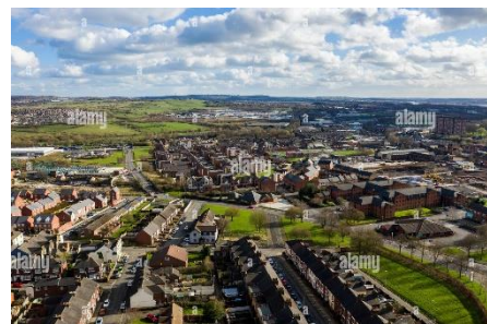
Local landscapes to inspire artwork