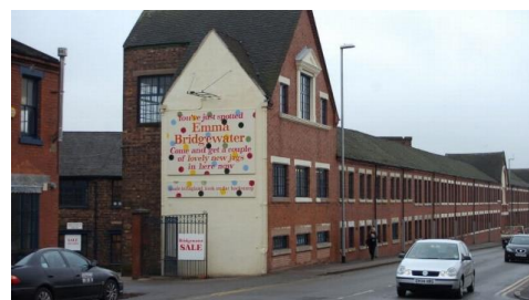
Local pottery industry