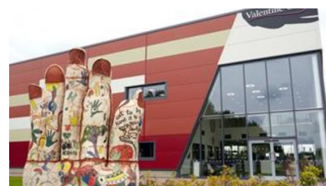
Love Clay Ceramics Centre