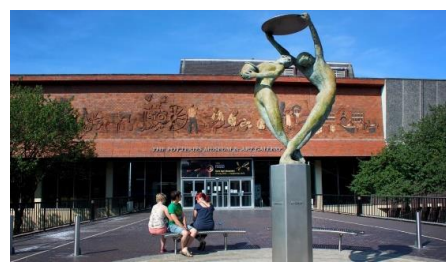
Potteries Museum and Art Gallery