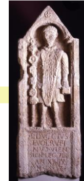
November: News from near and far