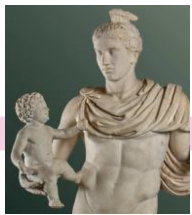
Ianuarius: New beginnings