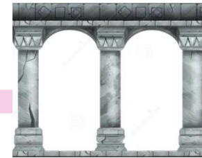
Maius: Timber into stone