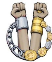
Iunius: All change for Pandora