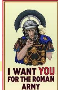
Augustus: Iulius joins the army