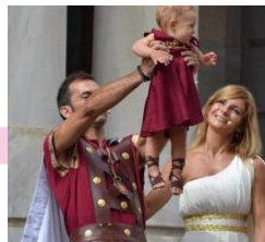
Martius: Wonderful days!