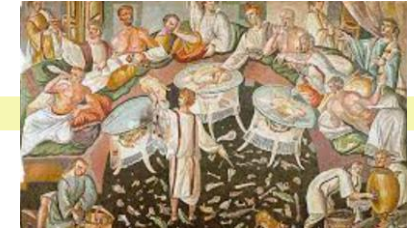
December: Time for celebration!