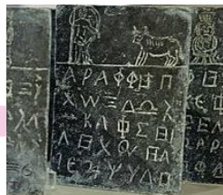
Februarius: Time for some Greek