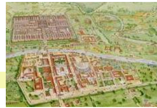
October: A new way of life in Eboracum