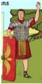
Iulius: Last days at Vindoland a