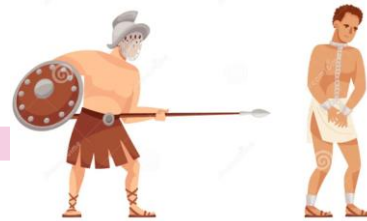
Aprilis: Comings and goings