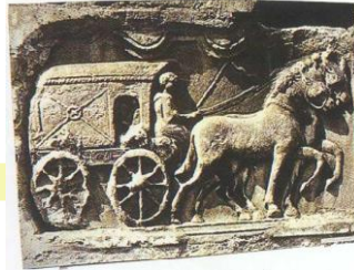
September: On the move