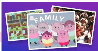
More Musical Styles