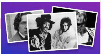
Musical Styles Connect Us