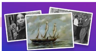
Developing Ensemble Skills