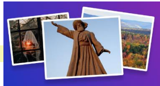
Melody and Harmony in Music