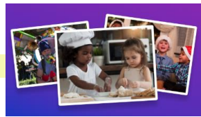
Recognising different sounds