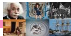
Expression and Improvisation