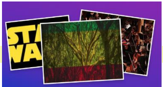
Enjoying Musical Styles