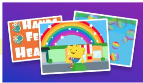
Inventing a Musical Story