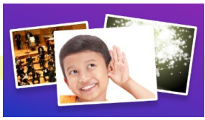
Playing in an Orchestra