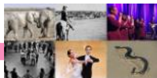
Compose with Your Friends