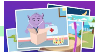
Having Fun with Improvisation