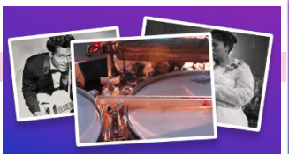
Improvising with Confidence