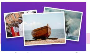
Playing in a Band