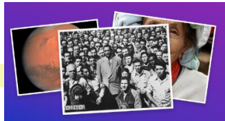
Sing and Play in Different Styles