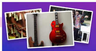
Music and Technology