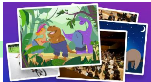
Dance, Sing and Play!