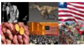
Exploring Feelings When You Play