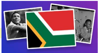
Composing and Chords