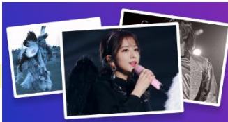
Freedom to Improvise