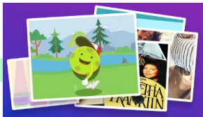
My Musical Heartbeat