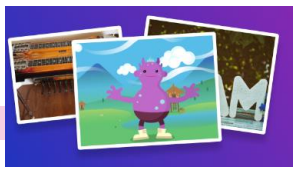
Writing Music Down