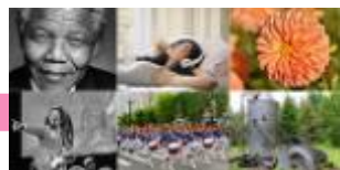
Feelings Through Music