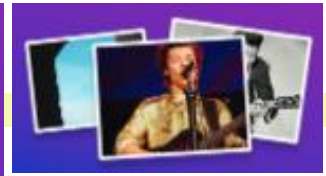
Battle of the Bands!