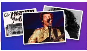
Compose Using Your Imagination