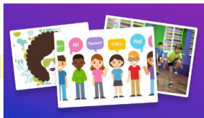
Pulse, Rhythm and Pitch