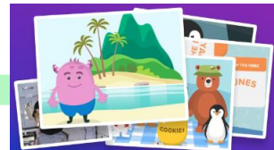
Learning to Listen