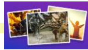
Our Big Concert