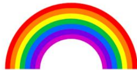
Our Vision and Values