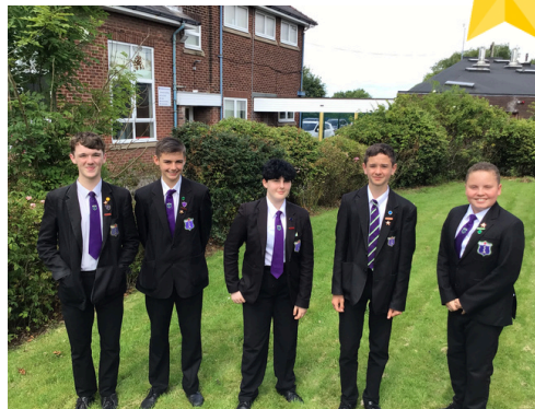
This academic year, we have awarded over 50 badges to our students as part of our end of year celebrations.

Each term, students who have been awarded 20 achievement points for attending a club are presented with a badge and certificate. This allows other students to easily identify representatives around school. These students aim to promote attendance to clubs along with answering any questions students may have.