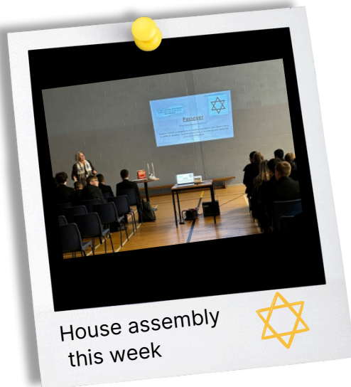
House assembly this week