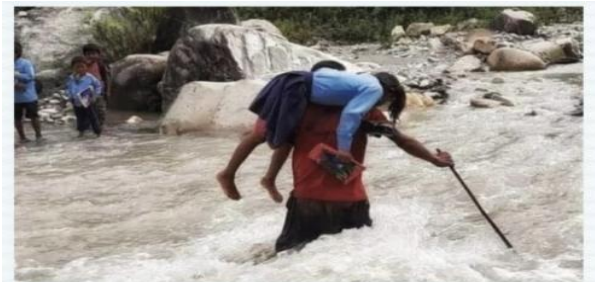
This photo captures the moment the school principal helps children cross a river on their way to school. Taken three years ago, this powerful image went viral, sparking national outrage across Nepal and drawing attention to the challenges faced by students in remote areas.