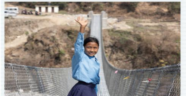
And this is the reality today, a community transformed, where new possibilities have opened doors to a brighter future.