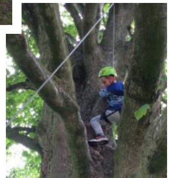
We have some great potential Robin Hoods