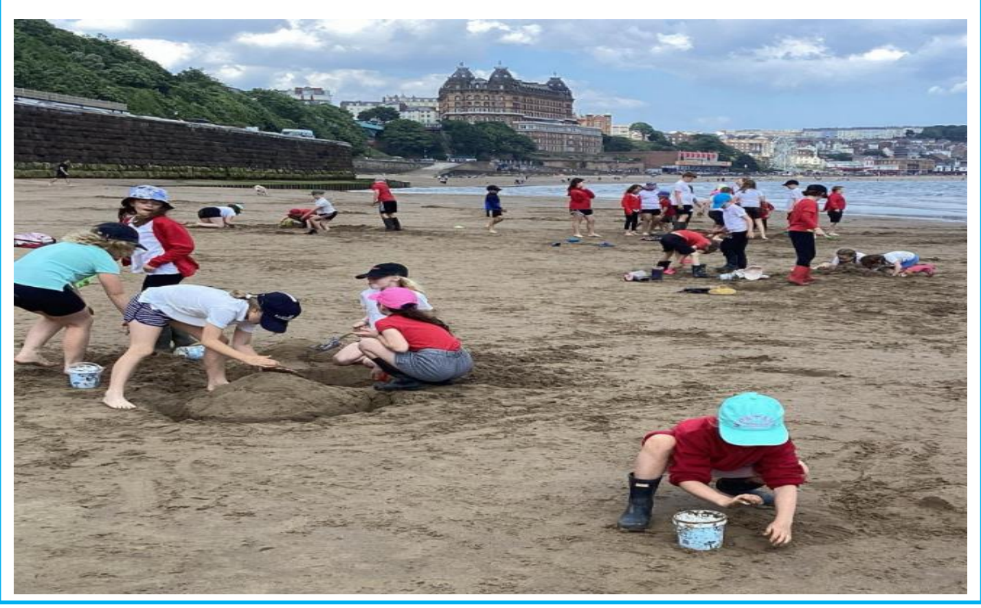
If you require this information in a different format, please contact the school office.