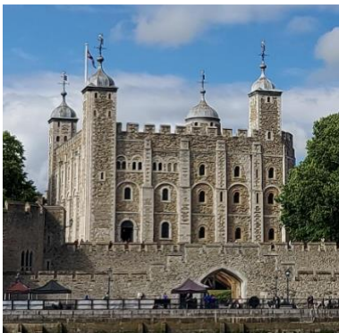
Tower of London.