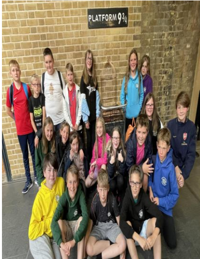
Platform 9 3/4.