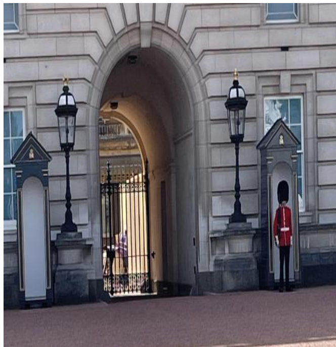
Changing of the Guard.