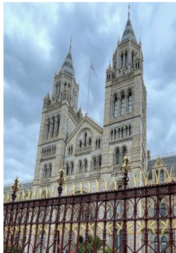
Natural History Museum.