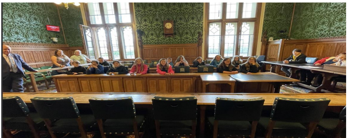
Houses of Parliament.