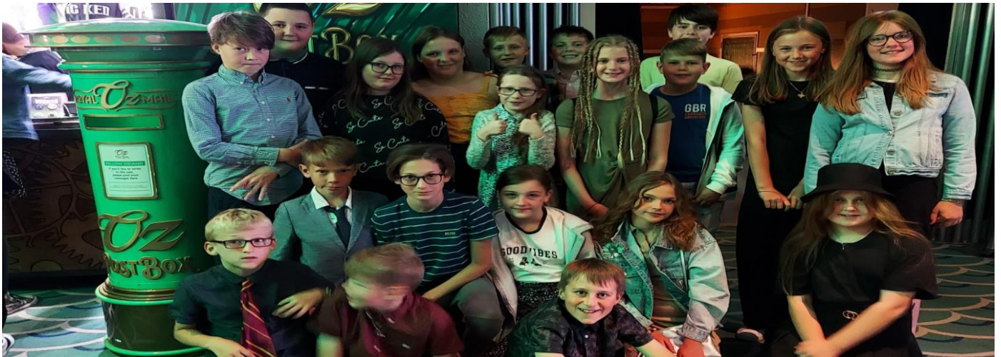
Apollo Victoria Theatre to see Wicked.