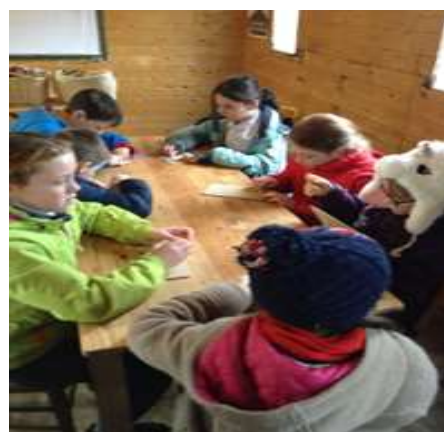
Creating thumb/pinch pots using Iron Age techniques