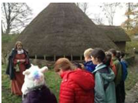
Using the Iron Age weaving loom

The children in Farthing Wood visited Ryedale Folk Museum as part of their Jurassic topic to take part in an Iron Age Activity Day.