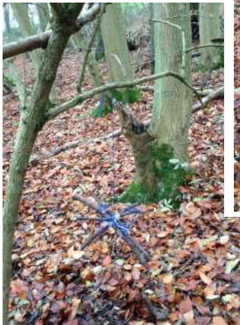
Knot tying spider webs