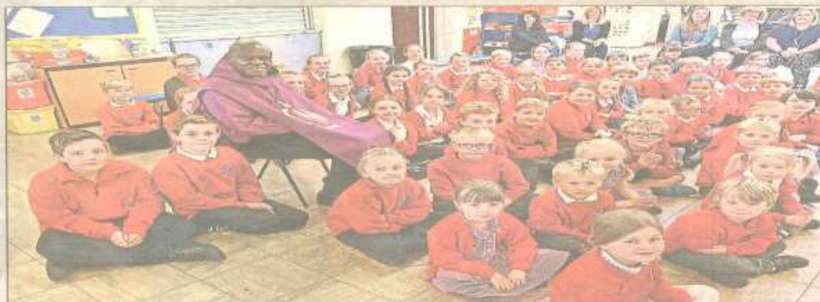
The Archbishop of York, Dr John Sentamu, visits pupils at West Heslerton Primary School.

YOUNG Leaders have been praised by the Archbishop of York for their work in the local community. Dr John Sentamu visited West Heslerton Primary School to see the projects carried out by pupils involved in the Young Leaders Award this year.