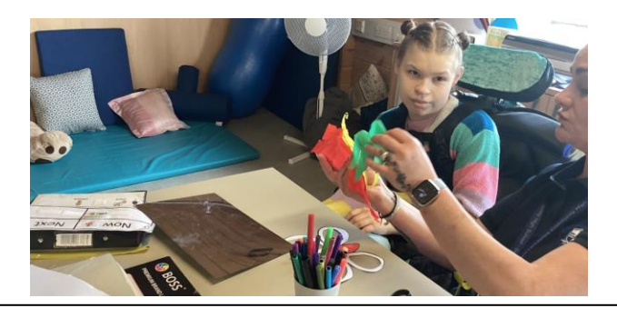
Dates for Diaries: 12<sup>th</sup> June – Parents Evening from 3:30pm

KS5S have enjoyed learning about the adventures of the Very Hungry Caterpillar. They listened to our sensory story and then made their own butterflies to go on their classroom window.