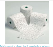
Fabric coated in plaster that is mouldable to surfaces