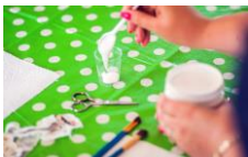
Creating images from layers of paper and glue