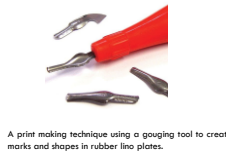
A print making technique using a gouging tool to create marks and shapes in rubber lino plates.