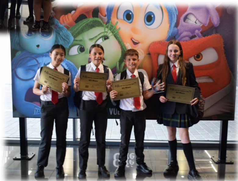
Winners from Year 7