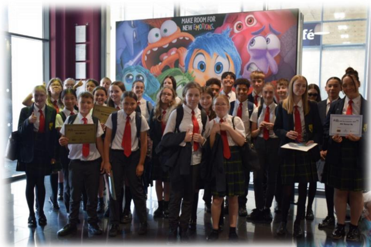
Nominees from KS3 Year 7-9