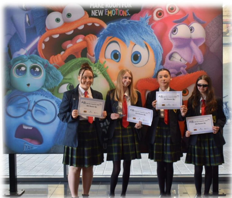
Runners-up from Year 9