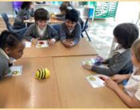
Programming the BeeBots to follow our algorithms.