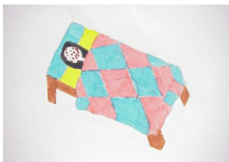
A sick child!

If a child becomes poorly during the course of the day or has an accident, it may be necessary to contact a parent quickly. To facilitate this please make sure that school is kept up-to-date with emergency contact details. School staff will care for the child until a parent arrives.