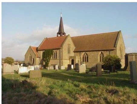
St. Luke's Church, Winmarleigh

As a Church of England Aided School our collective worship and ethos are rooted in Christian teachings and values. While parents have a right to withdraw their children from worship this will not insulate them from the Christian ethos in school.