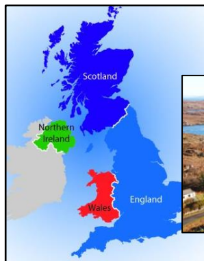
Island of Coll

Who was Grace Darling and why was she famous?