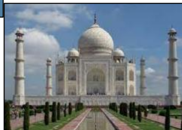
The Taj Mahal