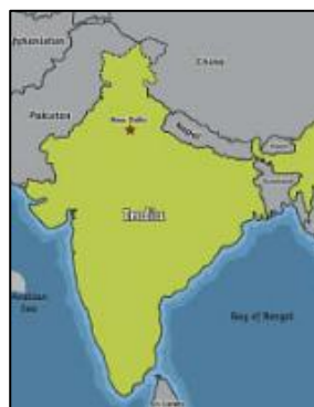
A map of India