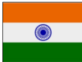
The flag of India