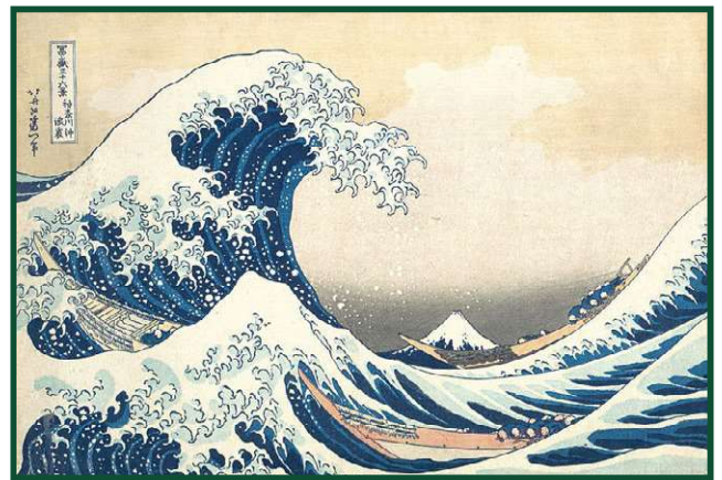
'The Great Wave off Kanagawa' by Katsushika Hokusai