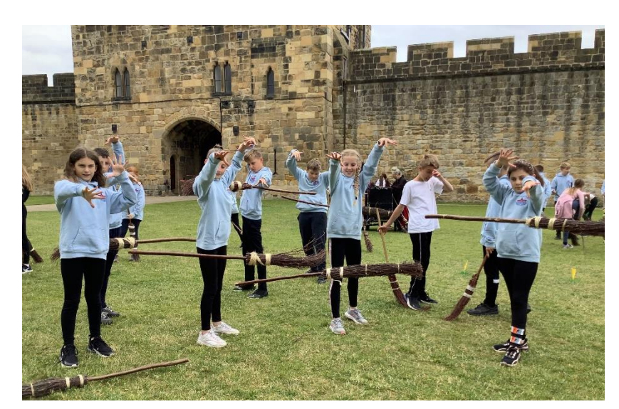
June 22 newsletter