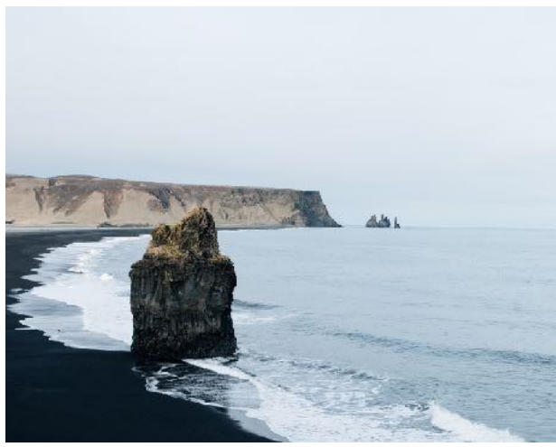
Professor Folklore 'Friend of the Troll'