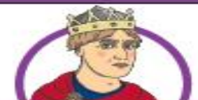
William the Conqueror