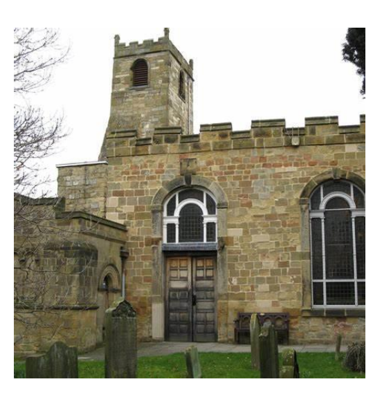
St. Mary Magdalene Parish Church Yarm